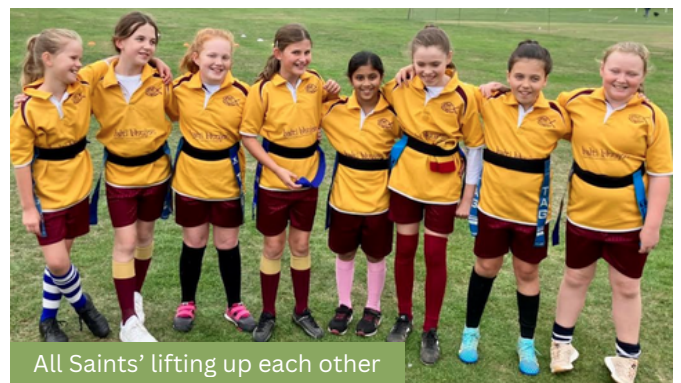
All Saints' lifting up each other

Well done UKS2 you blew our socks off! You came THIRD! You worked hard together and showed real determination. Well done for being such a positive and supportive team. Could we have some future England Rugby stars in our squad? We are so proud of you.