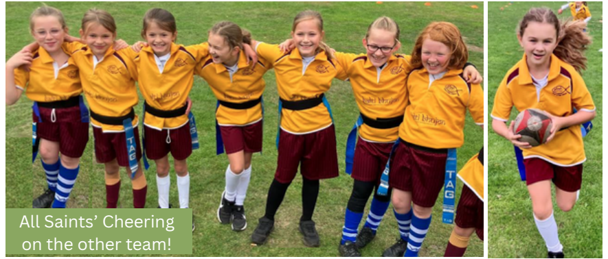
All Saints' Cheering on the other team!