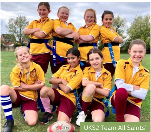
UKS2 Team All Saints'