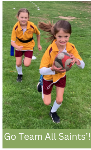
Go Team All Saints'!

"I think women's sport can really inspire the next generation of future England sporting greats. We have to get behind that and ensure that it happens," former England Rugby captain Sarah Hunter.