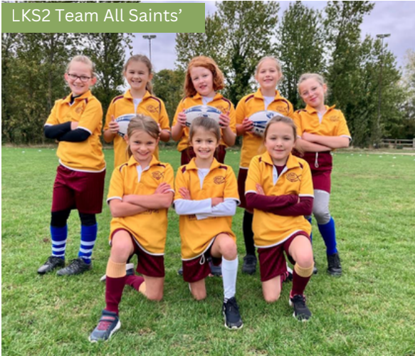
LKS2 Team All Saints'

A tough competition for our LKS2 team but they smashed it! The team finished in fourth place after a nail-biting game with extra time. The children showed great spirit and determination to prove All Saints' embrace everything that is thrown at them. What really makes us proud is the way they also support the other teams. Well done to everyone who showed up today. We hope you enjoyed the first sporting event of the year. You made us really proud.